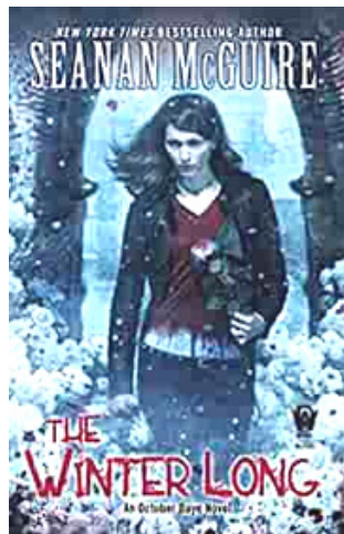
The Winter Long by Seanan McGuire